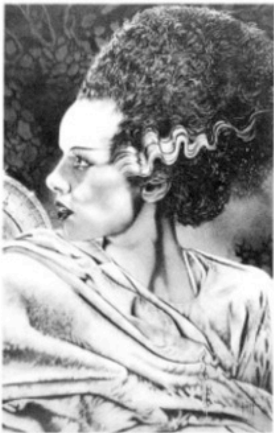
Above: Bride of Frankenstein . Right: John Wayne .