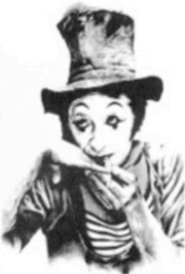
Poetry in Motion